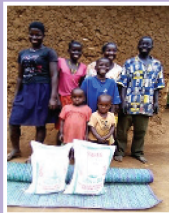
Families receiving maize flour and being blessed by BOJ’s recent Nutrition Program

Thank you so much for your overwhelming response to our recent request for support for the Nutrition Program. Your generosity helped fill a gap to meet the needs of 67 families, which our nutrition team identified as being in desperate need for food. BOJ was able to provide maize flour for each of those families.