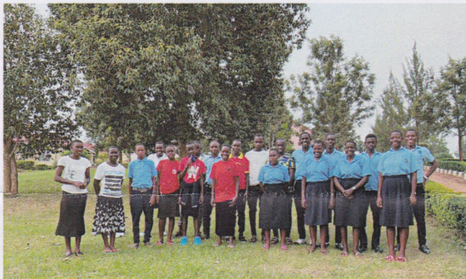
Africa with Love School and Clinic MJS Graduates January 2022

"For I know the plans I have for you," declares the Lord, "plans to prosper you and not to harm you, plans to give you hope and a future." Jeremiah 29:11 NIV